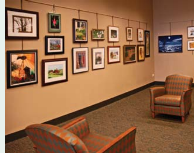
Artists are invited to exhibit their work at the Library