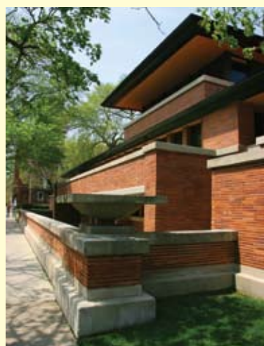
The Robie House, Oak Park, Illinois, designed by Frank Lloyd Wright