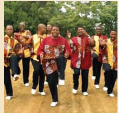
Ladysmith Black Mambazo comes to Fermilab Feb. 4.

There is also a 10% discount for Adult Priced Arts Series tickets for groups of 10 or more.