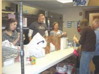
Left, parents form an assembly line checking expiration dates on donated items.